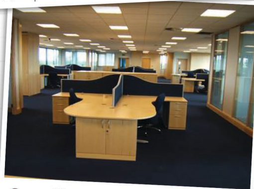
Open Plan Office